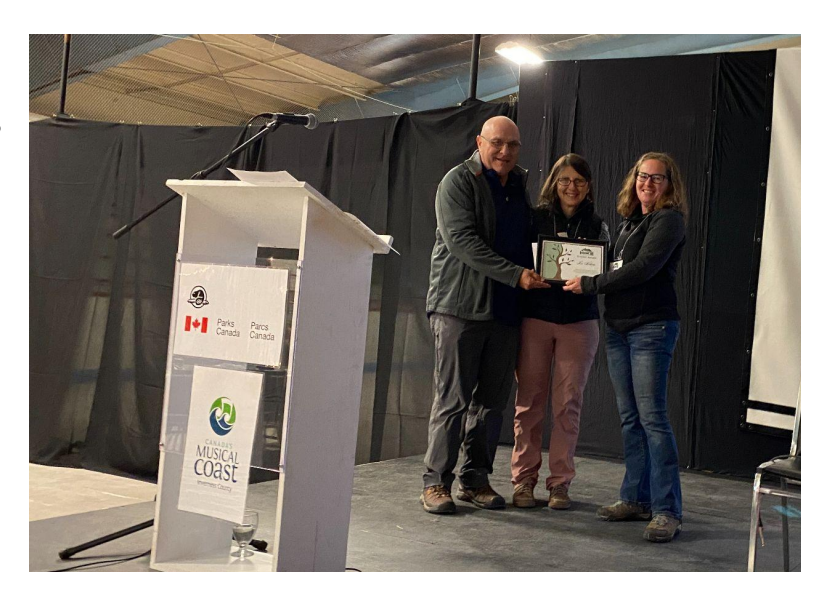
Les Hikers being presented with the Summit Award at the Hiking Summit, June 2022.