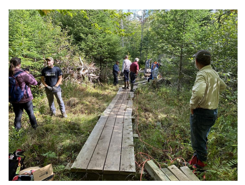
Trail building workshop in Earltown, September 2022.