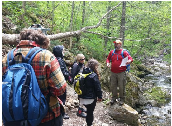
Participants are engaged in an Outdoor Council of Canada Field Leader – Hiking course in Baddeck in June 2015.