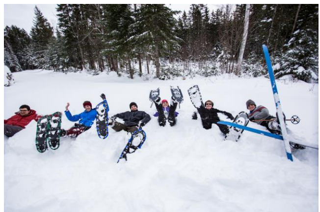
Folks play around while snowshoeing at the Carver's Woodlot hike in January in Lunenburg County during the Winter Guided Snowshoe Hike Series.